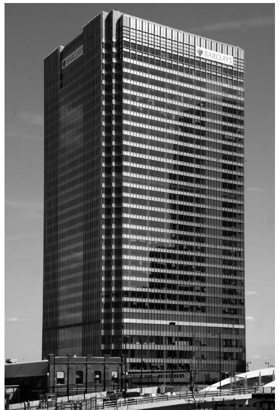
Barclays Group Headquarters, 1 Churchill Place