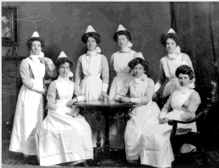
Nurses from Glasgow in 1909