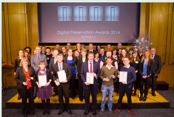
The DPC celebrates its bi-ennial Digital Preservation Awards

Last month The Bank of England became the latest in a line of business archives, including HSBC, Lloyds Banking Group and the Royal Institute for British Architects (RIBA), to join the Digital Preservation Coalition (DPC); recognising a need to address the growing concern of continuous access to digital content.