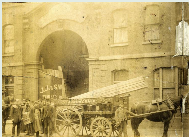
Chalk business premises, Riga Yard, Commercial Road, Whitechapel, c1900