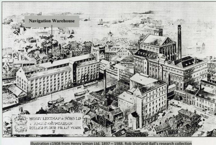
Illustration of Leetham's Mill c1908 from Henry Smith Ltd, 1897-1988