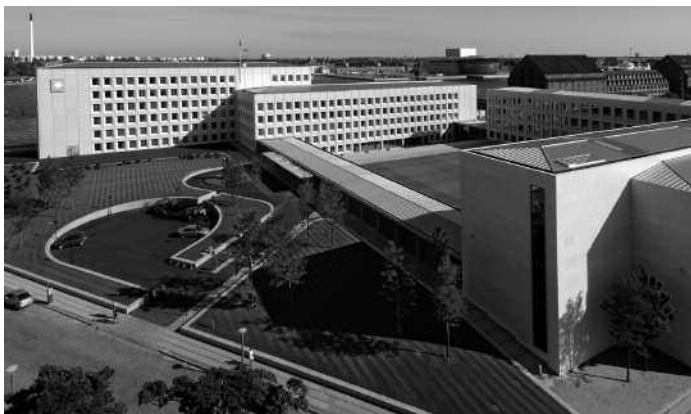
An impressive view of the Møller-Maersk HQ in Copenhagen

among its activities operates the world's largest container shipping company.