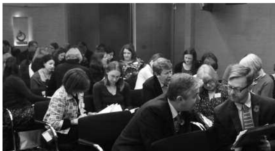
A full house gets down to the activity in the first session

The theme of the 2012 BAC conference was digital records – both those which are born digital, and those which have been digitised. The topic was chosen following feedback from BAC members and attendees at previous conferences, many of whom had expressed the need for discussion of the issue. The conference was hosted by the Baring Archive at ING's offices on London Wall and was well attended by archivists and records managers from both the private and public sectors – over 100 delegates in all.