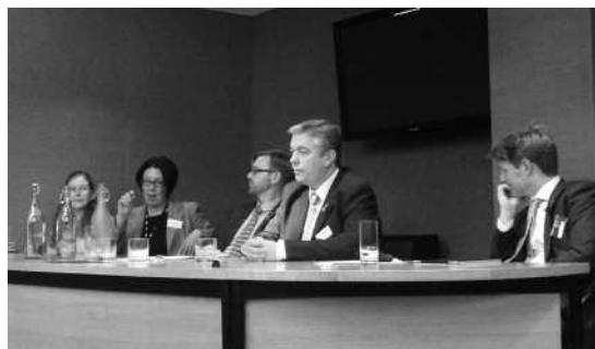
The panel answers questions